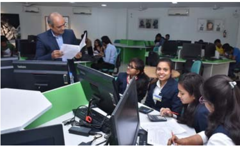
▲ Business Simulation Competition