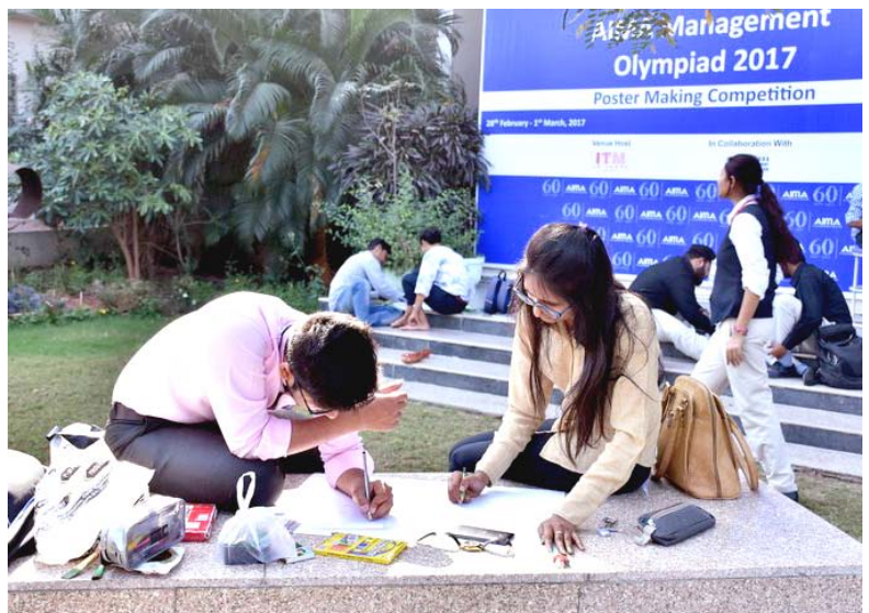
▲ Poster Making Competition