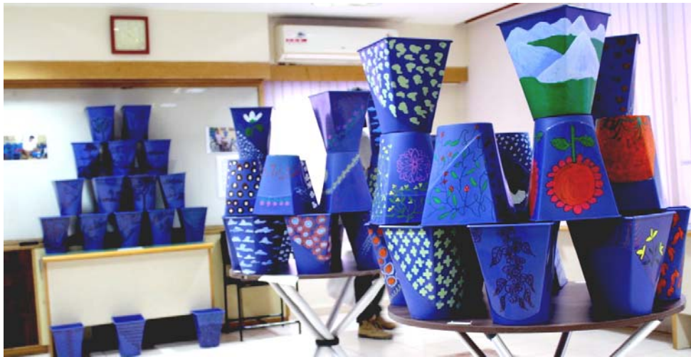
◀ Exhibition during the Management Week

For the first time the BMA's Management Week, started with an exhibition cum sale of Painting, Sculpture and Photographs that extended throughout the week 23rd to 29th May'2016.