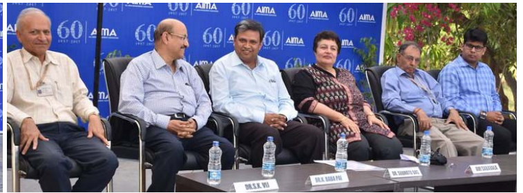
▲ Valedictory Session on 1st March 2017