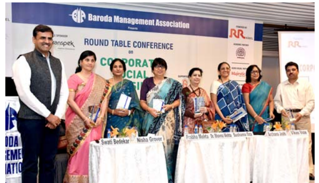
▲ Group photograph during the RTC CSR Panel Discussion Session-1