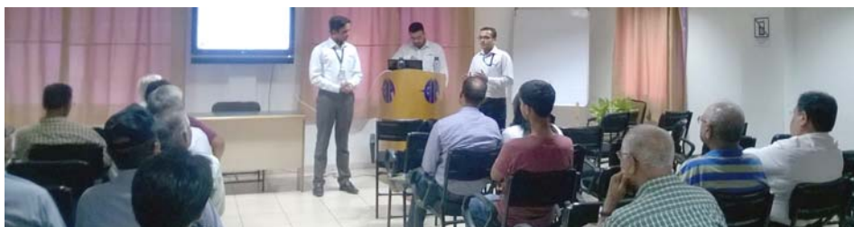
▲ Team Linde - Winning Team

25th May'16 : Presentations of the WINNING TEAMS of 25th AAOYM 2016 at BMA.