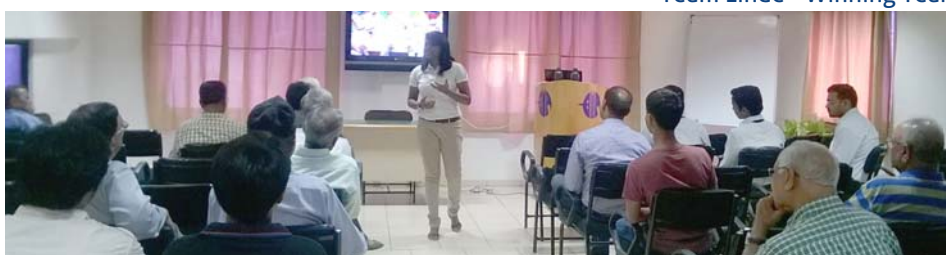
▲ Team New Gen Leaders - 1st Runner Up