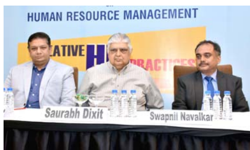
▲ Session 1 - Innovative Hiring Practices