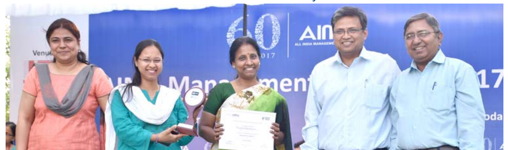
▲ Rolling Trophy won by the Faculty Of Social Work, M S University, vadodara