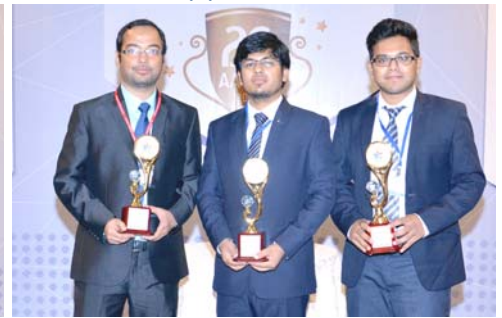
▲ Team GSFC Ltd. received the 1st Consolation