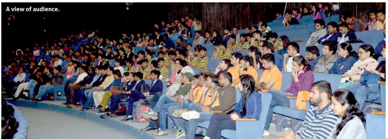
A view of audience.