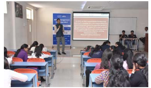
▲ Quiz Competition