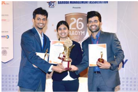
▲ Team Reliance, Dahej received 2nd Runner up prize