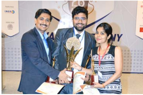
▲ Team L&T Tech Services received the First Prize

The young professionals were judged for the two preliminary rounds (on 16th and 17th FEB) and were further shortlisted for the final round of presentation on the 18th FEB 2017.