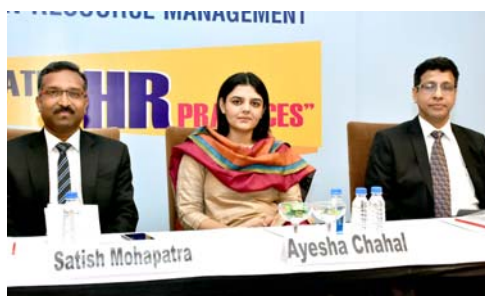
▲ Session 2 - on Creative Compensation Management