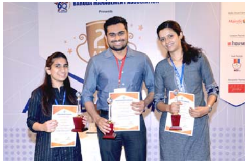
▲ Team Transpek Industry Ltd. received the 2nd Consolation Prize