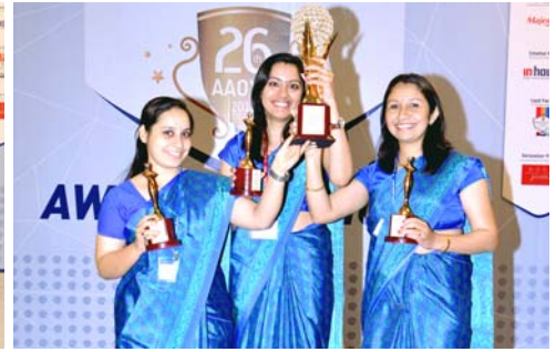
▲ Team GSFC Ltd. received the 1st Runner up prize