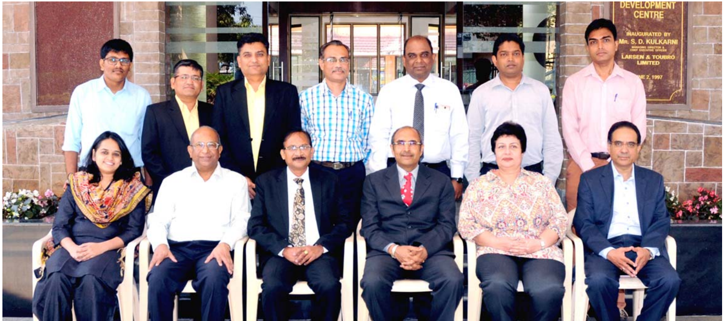
▲ Leadership Retreat - Lonavala - 2017

Venue : The Learning & Development Academy OF L&T, Lonavala