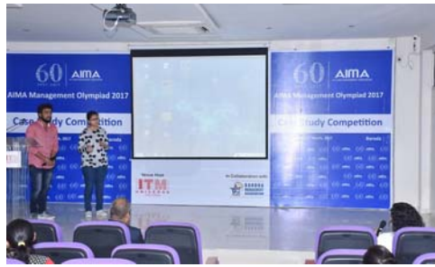
▲ Case Study Competition