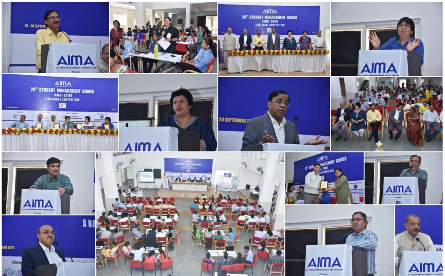
▲ Business Simulation & Management Games - 19 & 20 September 2016