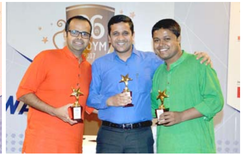
▲ Team Atul Ltd. received the 3rd Consolation Prize