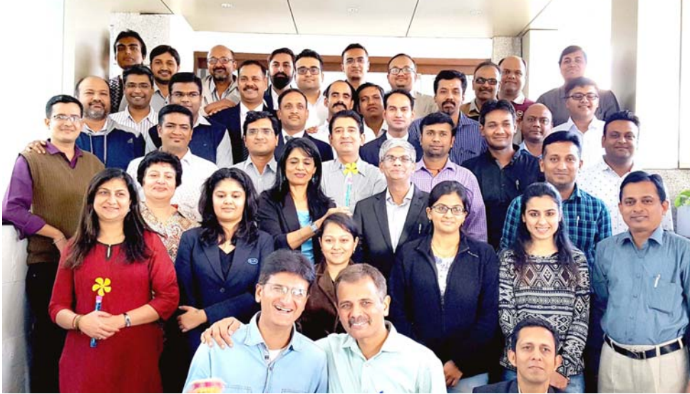
▲ A group photograph taken during the RTC on Innovation