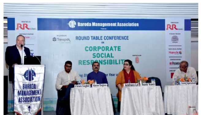
▲ Group photograph during the RTC CSR Panel Discussion Session-2