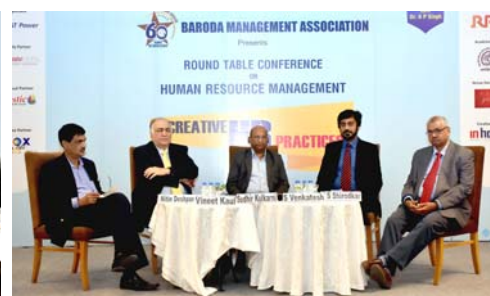
▲ Session 3 Panel discussion