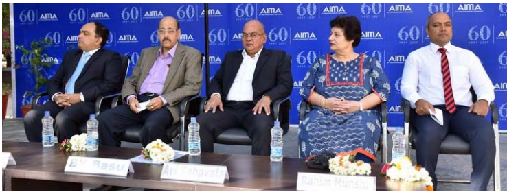
▲ Inaugural Session on 28th February, 2017

President and Head, Corporate Centre & Technology, L&T Power was the Chief Guest .