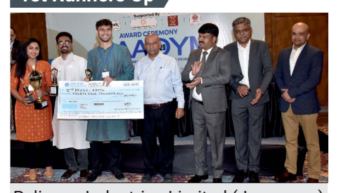
Reliance Industries Limited (Jamnagar)