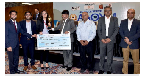
L&T Hydrocarbon Engineering Limited