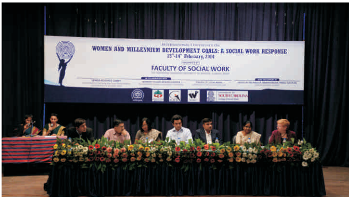
Dignitaries on the dais at the International Conference during the tribal session

The Faculty of Social Work, The Maharaja Sayajirao University of Baroda organised the International Conference on Women and Millennium Development Goals: A Social Work Response on 13-14 February, 2014 with Baroda Management Association as its Event Management Partner.