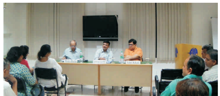
Office bearers and BMA Members in the 2nd Open Forum Members Meet

The 2nd Open Forum Members Meet of BMA, was held on 26th February'14 at Guru Narayana Center for Leadership, BMA. BMA feels that their Members are its key strength and to keep them happy is its highest virtue. The objective of organizing the meet second time was to cater its members the best services in terms of its management services. This meet facilitated the involvement, support and guidance from members as well as providing their valuable inputs and suggestions.