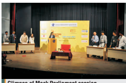
Glimpse of Mock Parliament session

to all participants and summarized at the end of discussion. Audience participated with hooting, yelling, laughing and whistling. There was a complete involvement of entire gathering with lots of applause.