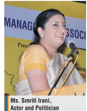
Ms. Smriti Irani, Actor and Politician

Ms Smriti Irani , Actor and Politician, was the first speaker of the day. She highlighted on the topic – “ Politics as Career ” for the youth. A very emphathetical speech with a good balance of mind and heart. She emphasized on various issues such as response of political parties on 33% reservation of women in parliament, corruption, violence on women, women’s safety and responsibility as citizens of India and so on. Responding