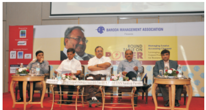
Dignitaries on the dais during the Inaugural session of Round Table Conference on Power

Hon'ble Minister for Energy & Petrochemicals, Gujarat, Shri Saurabh Bhai Patel, was the chief guest on the occasion. Inaugurating the RTC and delivering the Key Note Address, Hon'ble minister outlined the proactive measures adopted by the state to achieve remarkable turnaround of the sector from a loss making proposition of Rs 2500 Cr in 2002 to a surplus and profit making sector. Hon'ble Minister elaborated on how the implementation of innovative Jyoti Gram Yojna (JGY) for supply of 24 x 7 power, has transformed lives of vast rural population and people living even in remote areas and contributed immensely to the development and improving quality of life of the people of the state.