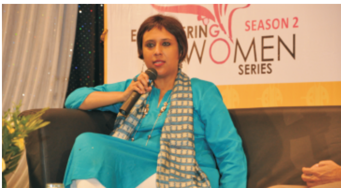
Ms. Barkha Dutt during the Interaction with the audience