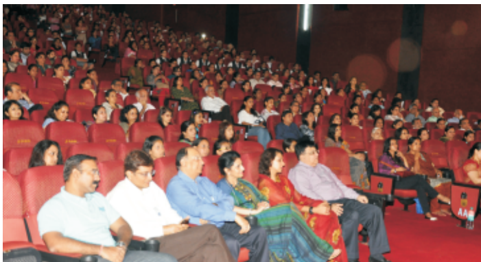
Large turnout of audience during Follow your Passion with Burkha Dutt