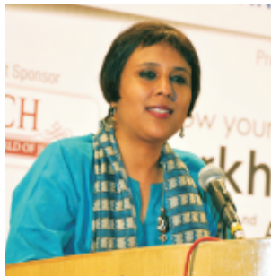
Ms. Barkha Dutt (NDTV Group Editor) addressing the Audience

Her mother remaining her inspiration always whom she lost at a tender age of 13 years. At 26 she followed her heart to cover