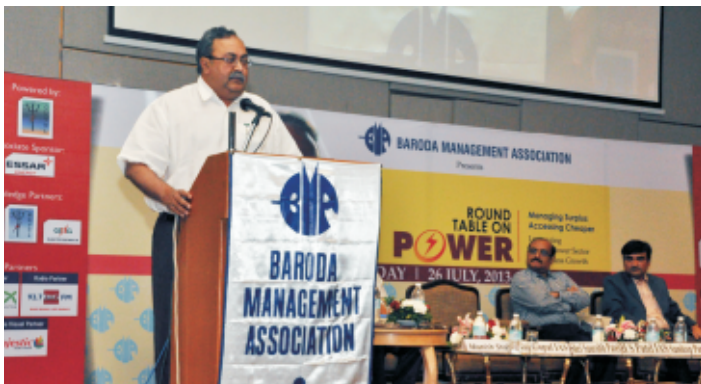
Shri Saurabh Patel, Hon'ble Minister for Energy and Petrochemicals addressing the audience during the Inaugural Session

The Gujarat Power sector today is the most exemplary turnaround success story with supply of 24 x 7 power in all parts of the state. Many more states are now on way to learn lessons out of Gujarat model and emulate the success story.