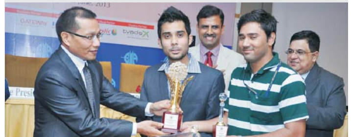
2nd Runners Up - L & T Power