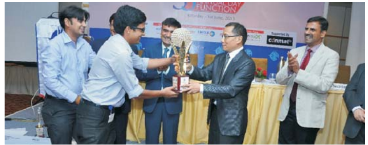
Winner - Piramal Glass Ltd.