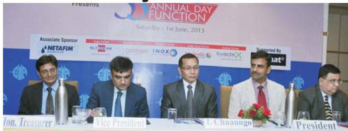
Dignitaries sitting on the dais during the celebration of 55th Annual Day Function of BMA