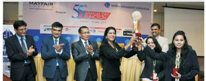
1st Runners Up - Aditya Birla Minacs