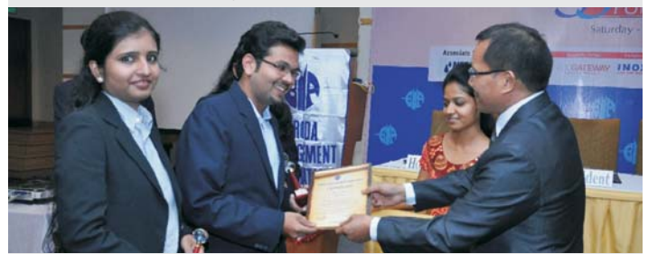
Consolation Prize - GETCO