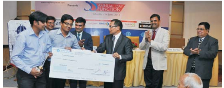
Winners receiving Cash Prize