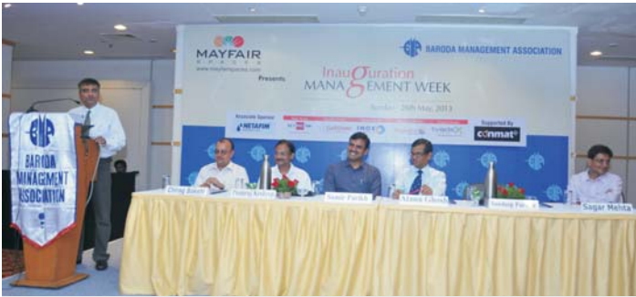
Dignitaries during the Inaugural Ceremony of Management Week

Every year BMA celebrates Management Week in the last week of May/ 1st week of June. In order to bring members to a common platform, Management Quiz and Special Talk on Management issues were arranged and eminent speakers were invited to share their views on the topics. All the members were invited to take advantage of the available expertise during this week. This week provided opportunity to network and exchange ideas