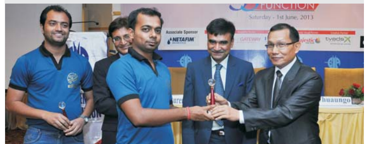
Consolation Prize - L & T Chiyoda