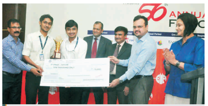
2nd Runners Up - Linde Engineering India Pvt Ltd