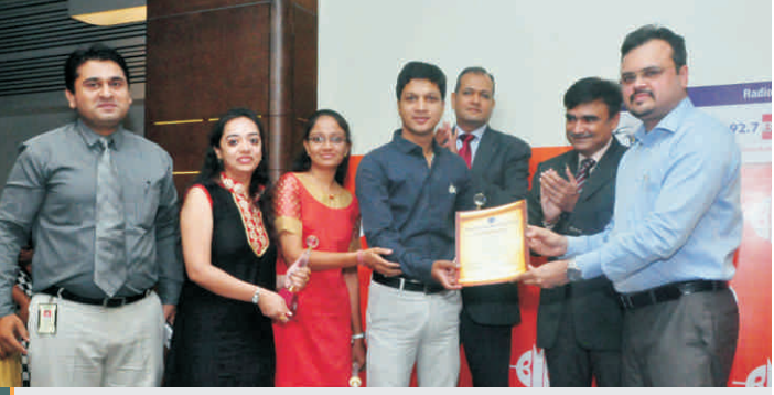
Consolation Prize - Vasu Healthcare Pvt Ltd