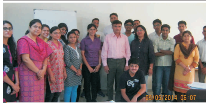
Faculties along with the participants of IMAGE course