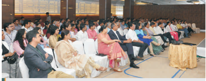
Audience at the Inaugural Session of Management Week

The competition for the 23rd AAOYM (Annual Awards for Outstanding Young Managers) was held from 25th – 27th May'14 where the avid participants of various reputed organizations delivered their presentations on various Management Topics and they were judged by eminent panel of the Jury who are well versed in their respective spheres.