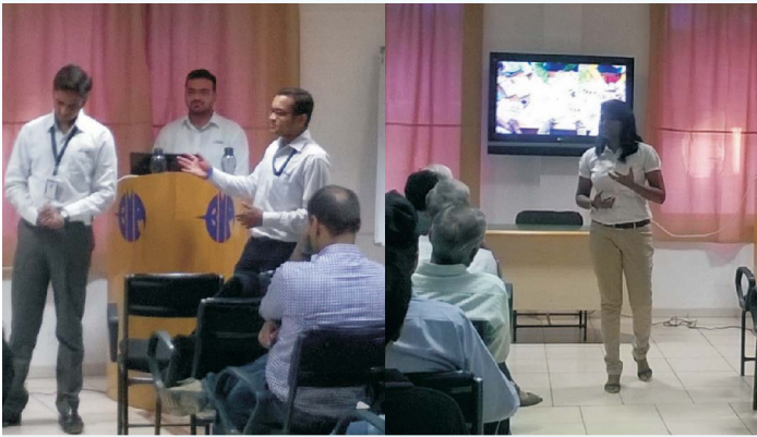
The Session was addressed by the winning teams of 25th AAOYM 2016