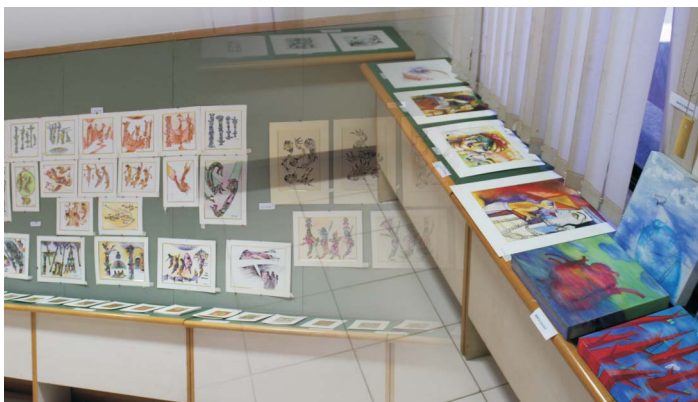
The display of exhibition cum sale during the management week of BMA FROM 23rd to 29th May 2016.