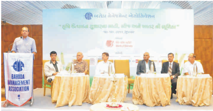
Dignitaries on the dais during the Inaugural Session of the Cooperative Seminar