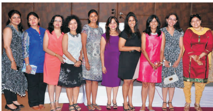
WDC Committee Members

The WDC committee was very happy and all members felt that one more of such workshops should be conducted as the general feedback was for more and more of such relevant topics related to the day to day betterment for more productive and effective life.