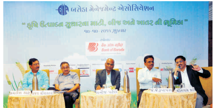
Panel Discussion during the Cooperative Seminar on Agriculture

Crop Production is less compared to China where the Land is Less and Crop production is more. He stated that the reason behind this Issue can be resolved by the Balanced Used of Fertilizers in India especially in Crop Production.