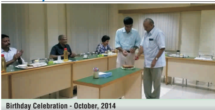
Birthday Celebration - October, 2014